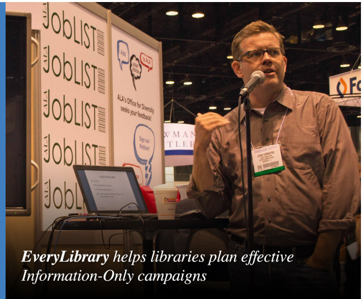
EveryLibrary helps libraries plan effective Information-Only campaigns

American Alliance of Museums - SMAC American Library Association - OLA and CALM Illinois Library Association California Library Association